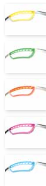
Sample of lighting color options

Please recycle. Printed in USA. © 3M 2010. All rights reserved. 3M, SelfCheck and Tattle-Tape are trademarks of 3M.